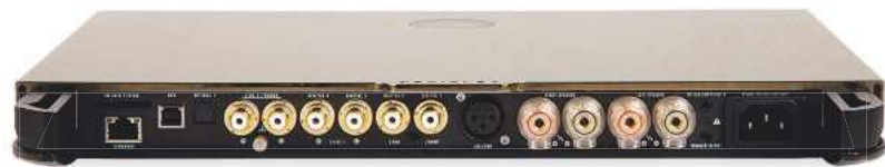
ABOVE: Three sets of RCA sockets are configurable as digital ins or line/phone analogue ins. Other digital ins include USB, ethernet (RJ45), AES/EBU (XLR), optical (Toslink and 3.5mm jack). Single sets of 4mm speaker cable binding posts are included alongside SD card (setup) and triggers (3.5mm jacks)

despite it being a render of an analogue tape, each key tailing off into a soft and gentle silence, coaxed by a lilting double bass. Then there was the 24-bit Abbey Road remaster, 'Come Together' which not only sounded 'all of a piece' but could hardly be described as a 'period piece' since the resonant grunge of Harrison's guitar and Starr's drums was laid bare with a sense of spaciousness and atmosphere that was barely creditable. Here was this liquid smoothness in action – the precision of the ADH technology delivered with a delicacy, a sensitivity and musical poise that is not only rare but arguably unique to the brand.