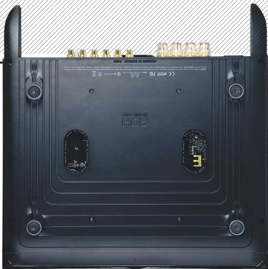
ABOVE: The underside of the 170 is an alloy injection-moulding with apertures for the (ZigBee) Wi-Fi antenna. Though still 'square' the case is about ½in smaller than the original D-Premier

and despite needing a PC in the room with short USB cables or Ethernet cable out to a NAS drive, the hard-wired options had Wi-Fi beat every time. And this magazine is always about the best that can be achieved, convenience be damned!